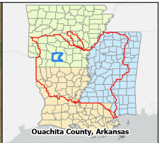
Ouachita County, Arkansas