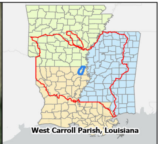
West Carroll Parish, Louisiana