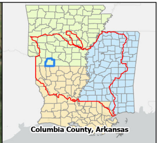
Columbia County, Arkansas