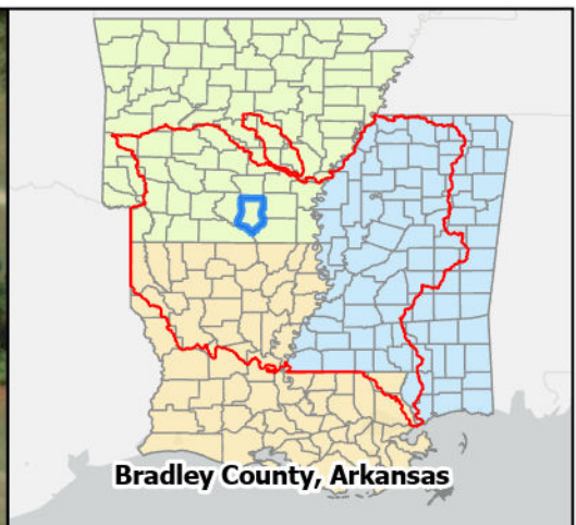
Bradley County, Arkansas