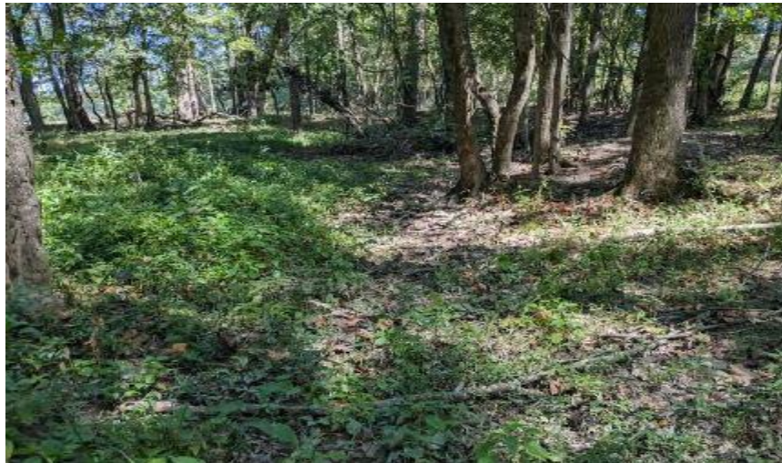
Representative photo of Non-RPW 1.

Non-RPW 4 according to delineation submitted by applicant, the feature originates and terminates onsite, lacks an OHWM, and flows only in response to rainfall. These observations were verified in the field by USACE on 2/5/2024 during a higher than normal rainfall period per the APT tool.