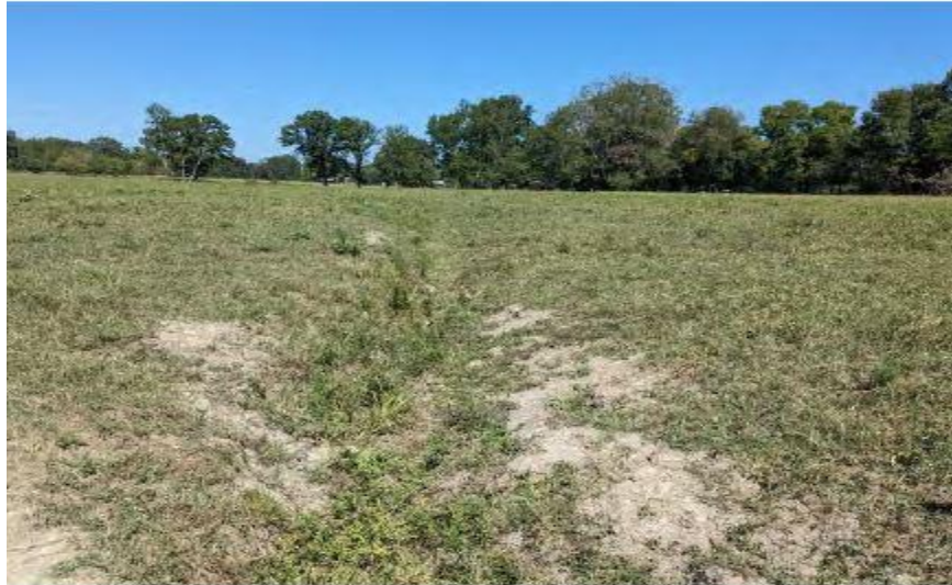
Representative photo of Non-RPW's 2, 3, and 4 .

SUBJECT: Pre-2015 Regulatory Regime Approved Jurisdictional Determination in Light of Sackett v. EPA , 143 S. Ct. 1322 (2023), MVK-2023-848