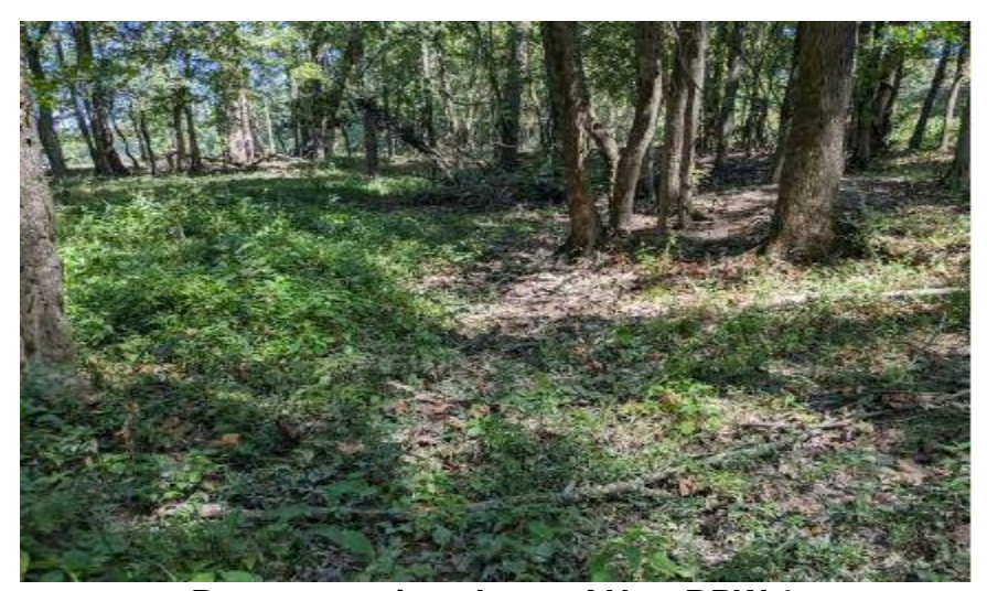
Representative photo of Non-RPW 1.

Non-RPW 4 according to delineation submitted by applicant, the feature originates and terminates onsite, lacks an OHWM, and flows only in response to rainfall. These observations were verified in the field by USACE on 2/5/2024 during a higher than normal rainfall period per the APT tool.