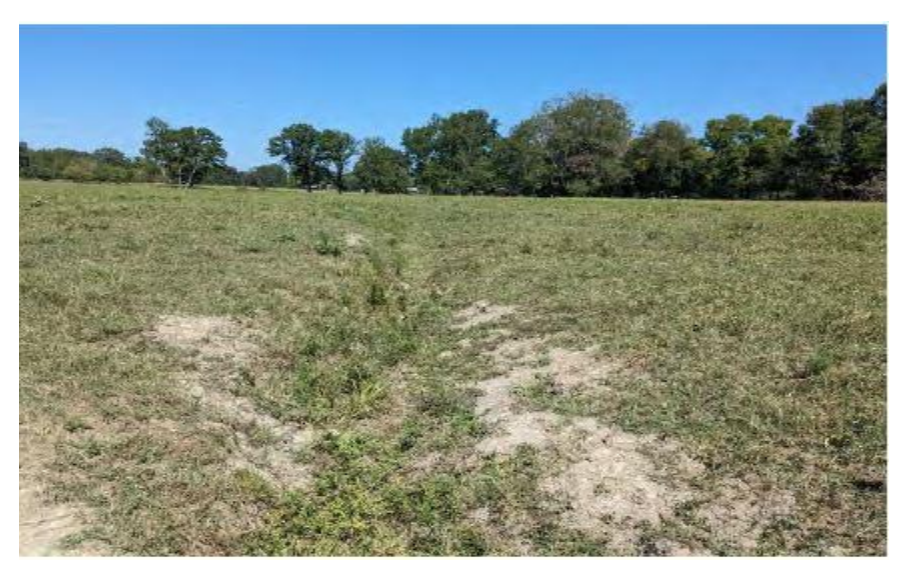
Representative photo of Non-RPW's 2, 3, and 4.

SUBJECT: Pre-2015 Regulatory Regime Approved Jurisdictional Determination in Light of Sackett v. EPA , 143 S. Ct. 1322 (2023), MVK-2023-848