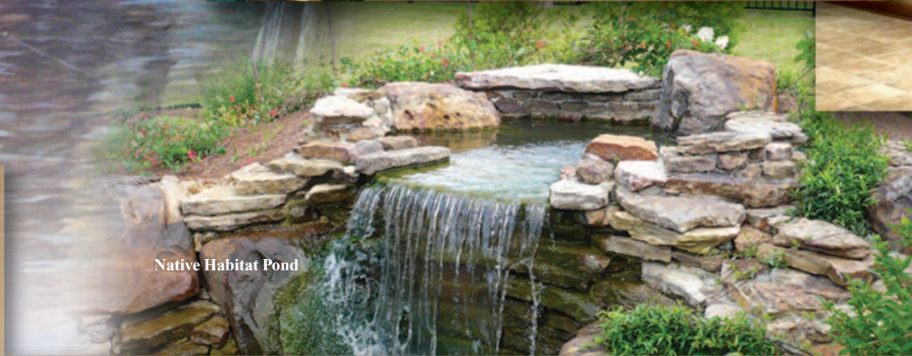
Native Habitat Pond

The Visitor Education Center is also home to extensive wall murals created by Mississippi artist Don Jacobs that feature anglers and natural north Mississippi habitats. Volunteers assist with greeting the public, giving